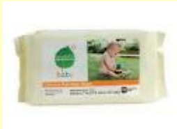
Baby Wipes Refills

Thank you for donating extra supplies last week!!!